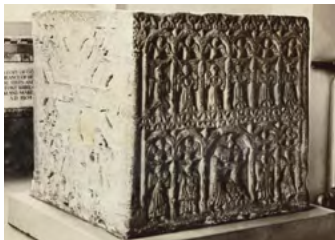
A Norman font at Lenton St Anthony

Across the road and Hill Side road takes you along the Leen to the site of Lenton Priory (21), whose last Prior was executed for treason. The graves of 27 nuns can be found