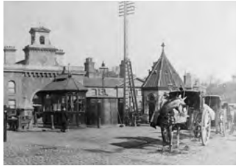
Canning Circus, c.1895

Alternatively, go southwards, crossing over Derby Road. This road was once notorious for highwaymen and Nottingham so riotous that dragoons were