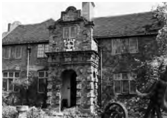
Strelley House, Bulwell, c.1974