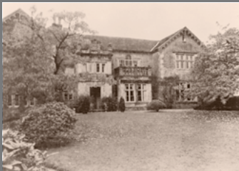
Broxtowe Hall, c. 1930s