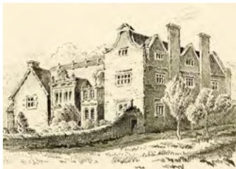
Broxtowe Hall, c.1835

Bulwell (1). Before boarding the bus at Bulwell Bus Station, be sure to have a look at Strelley House, within yards of the Market Place and dating from 1667. You can also pick up some provisions on market days: Tuesday, Friday and Saturday, and have a look at the (purported) site of the original Bulwell well inside the hardware shop near the bus station.