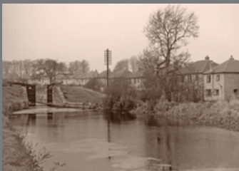
Nottingham Canal at Wollaton, c. 1955