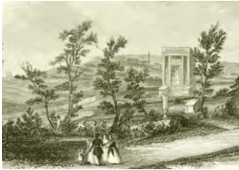
General Cemetery, c. 1841

‘Saturday Night & Sunday Morning’, based on Alan Sillitoe’s novel of the same name about working class life in Nottingham. Behind are the Lenton Flats, built in the 1960s and now being demolished. Join the bus here for a lift up the hill.