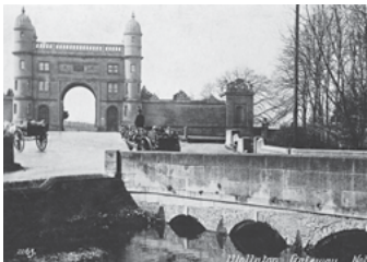
Lenton Lodge, c.1905

Back to the bus, and had you stayed on board for this section, you will have seen the Abel Collins Almshouses (17), tracing their origins back to 1704. In contrast, Adams Hill is the site of some of Nottingham's most expensive homes. Behind is a golf course. To have a look round, alight at Uni North Entrance (18).