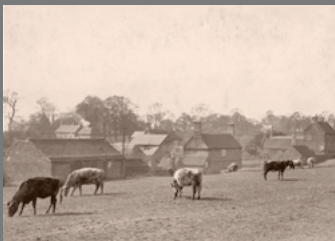
Old Bilborough village, c. 1933

in Broxtowe. A little further on, early Puritans on their way to Bilborough's parish church; 16th century hewers in Strelley loading coal into horse drawn wagons on the railway.