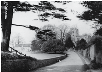
Strelley Village, c.1910