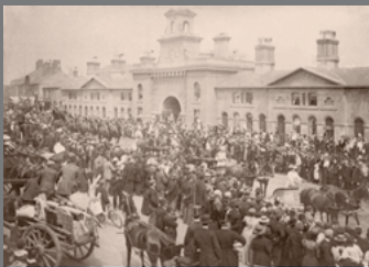
Canning Circus, c.1895

The number 35 is a special bus route from a history lover's perspective. It passes through, or near, nine of Nottingham's fifteen Domesday communities, the site of a Roman Fort and the world's first known railway built in 1603–4 to carry coal from Strelley to Wollaton.