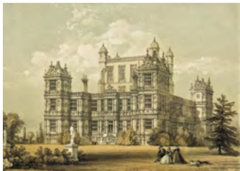
Wollaton Hall, c.1858

Rejoin the bus at Wigman Road Top (10) for a panoramic view of the city as the 35 turns into Bracebridge Drive. As you pass Bracebridge Drive Shops (11) there is also a magnificent view of Wollaton Hall. Also see TravelRight's guide to this area, A New World www.travelright.org.uk/bilborough